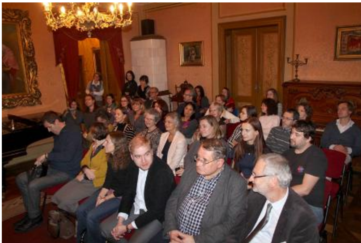
The audience warmly greeted the musicians