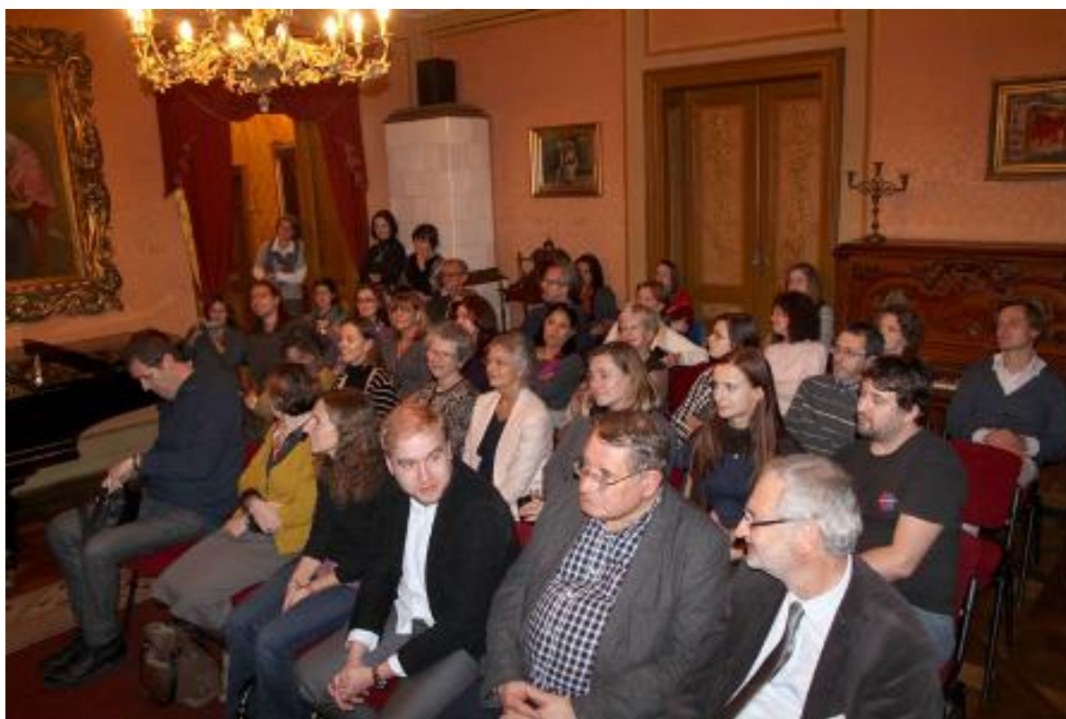
The audience warmly greeted the musicians